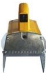
SH 1100 S